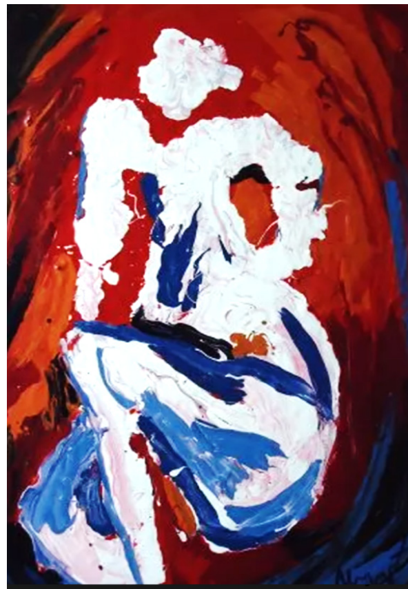
Zoran Hercigonja (Hrvatska / Croatia) EARTH'S SHE CORE Lakovi za metal / Varnishes for metal