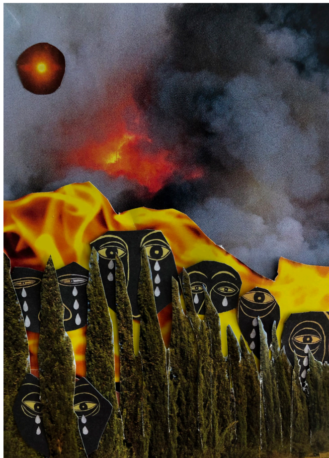
Leman Bedia Güven (Turska / Turkey) WAITING FOR THE SPRING Ugljen / Charcoal