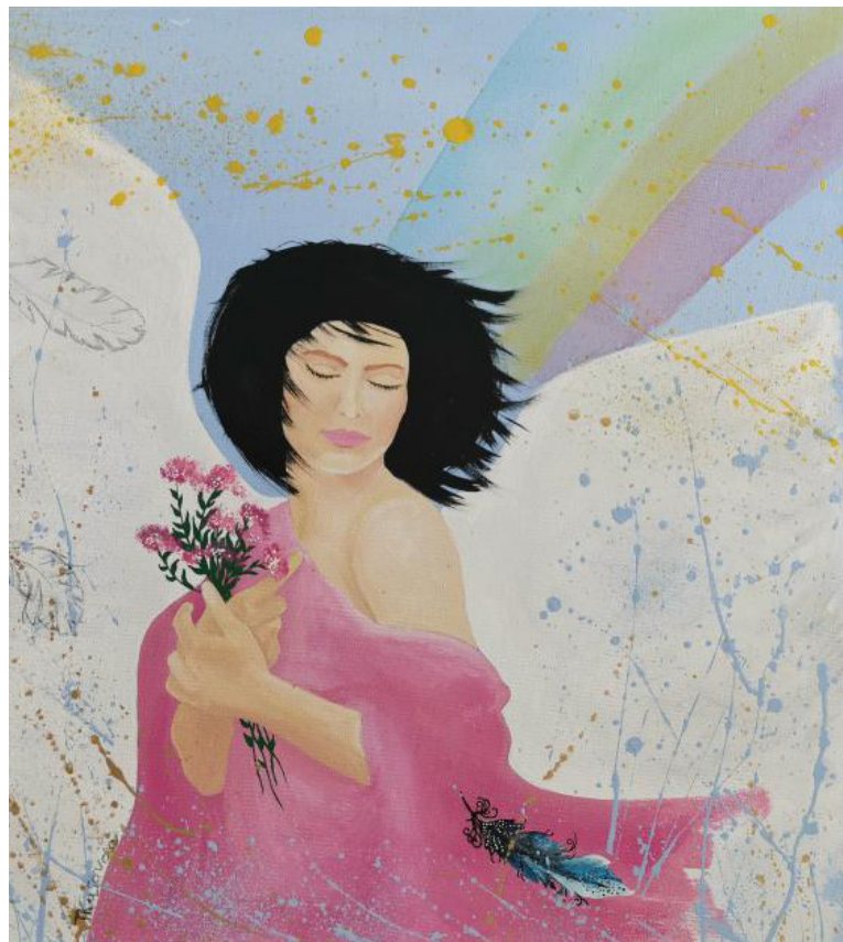
Tamara Kusovac (Srbija / Serbia) TALAS SEĆANJA Akril / Acrylic painting