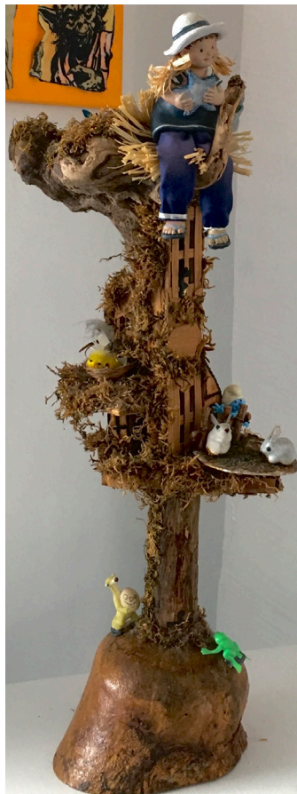
Yeşim Agaoğlu (Turska /Turkey) IN THE FOREST Instalacija kombinovana tehnika / Installation Mixed media