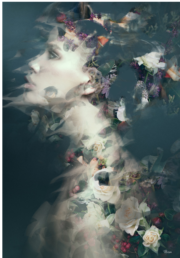
Bojan Jevtić (Srbija / Serbia) THE GIRL WITH THE ROSES Digitalna fotografija / Digital Photography