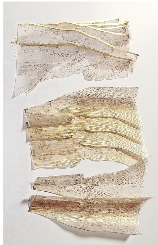
Ljiljana Bursać (Srbija / Serbia)