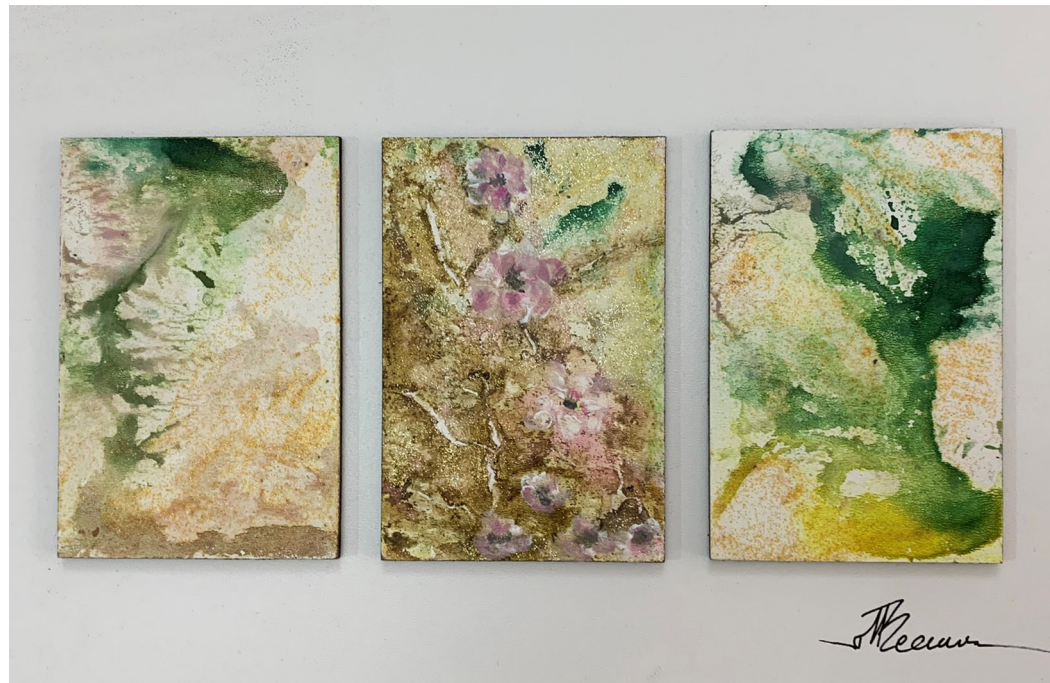
Vesna Maksimović (Srbija / Serbia) SEĆANJA Slika na svili / Painting on silk